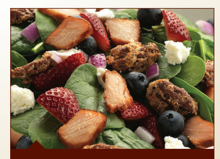
Cracked Peppercorn Smoked Salmon Salad

Visit our website for more great smoked salmon recipe ideas!